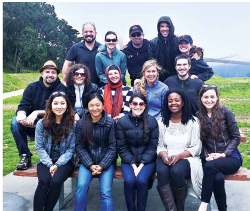
San Mateo County Behavioral Health and Recovery Services Program