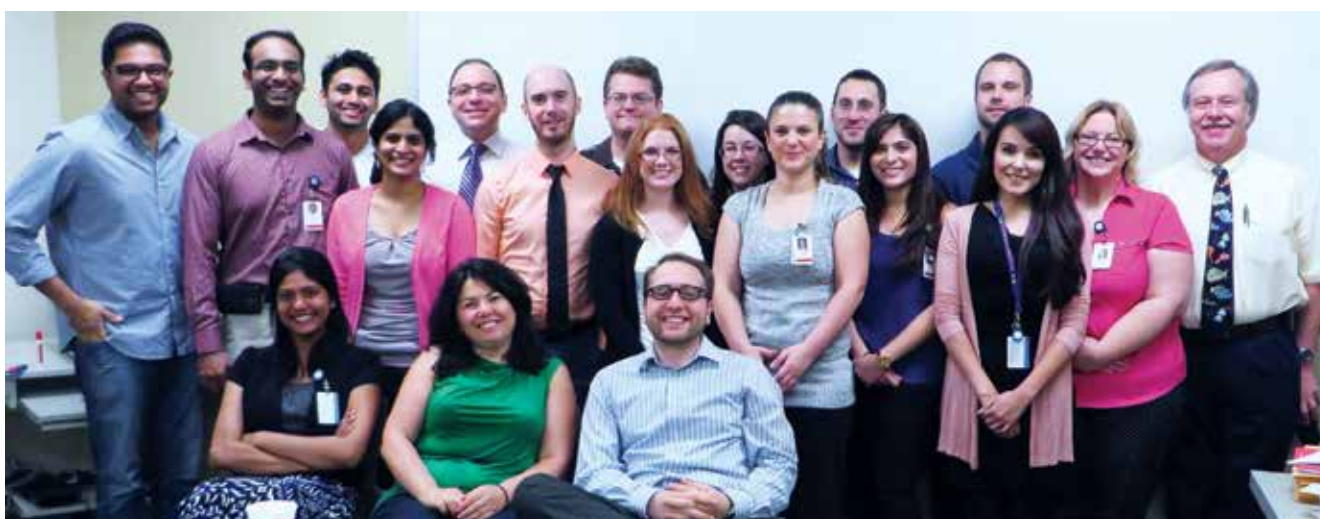
West Virginia University/Charleston Area Medical Center

APA is offering a new member benefit for members who are practicing in the United States and Canada. They are invited to join a database being added to APA's website that will enable individuals seeking psychiatric care to locate psychiatrists practicing in their area. The goal is to populate the database, known as "Find a Psychiatrist," in the coming weeks before it goes live on APA's website. To join the database, go to http://apps.psychiatry.org/optinfap/Login.aspx . To view the functionality of the database, go to http://finder.psychiatry.org/ .