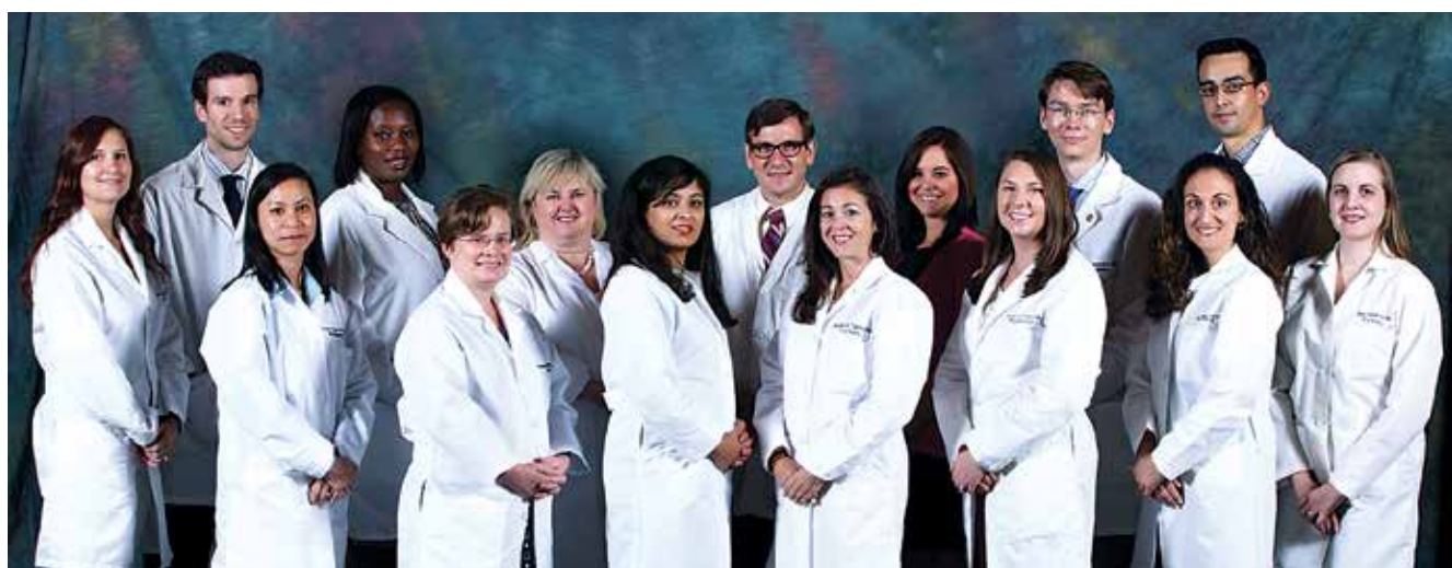
University of South Alabama