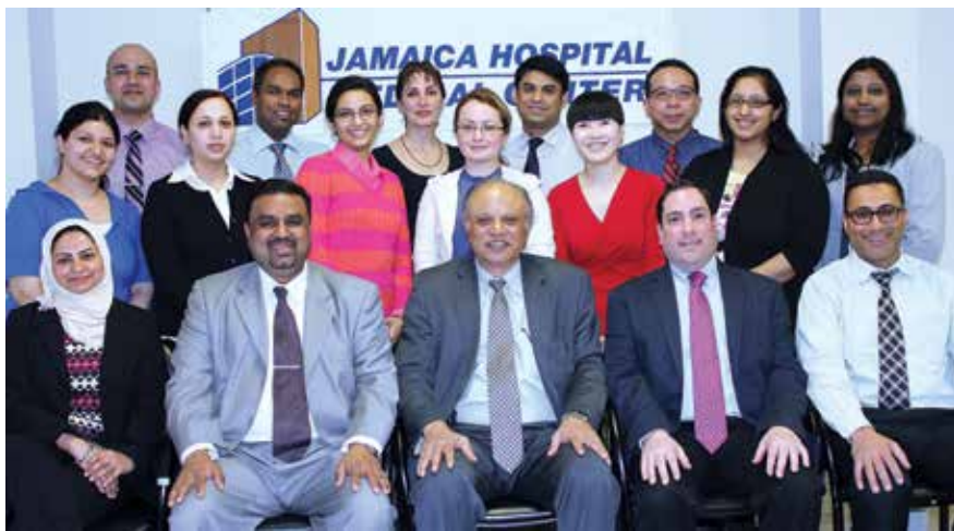
Jamaica Hospital Medical Center