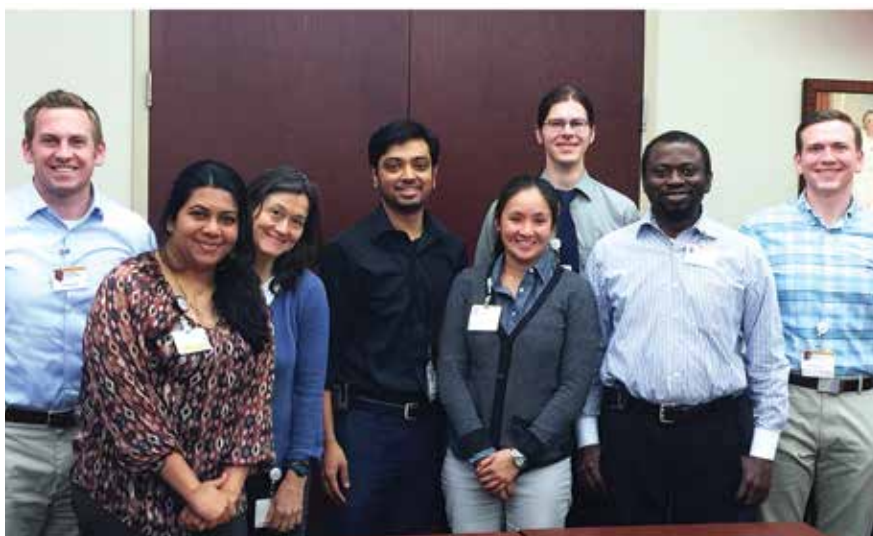
Wake Forest University School of Medicine

Bergen Regional Medical Center Program Brookdale University Hospital Medical Center Program Detroit Medical Center-Wayne State University Kaiser Permanente-Fontana Lincoln Hospital Loyola University Medical Center Medical College of Georgia NSLIJHS-Hofstra North Shore-LIJ School of Medicine at The Zucker Hillside Hospital SUNY Downstate University of Buffalo University of Minnesota