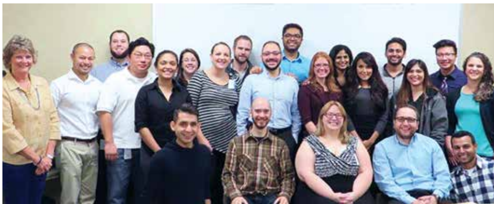
Charleston Area Medical Center/West Virginia University (Charleston Division)