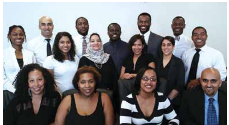
Morehouse School of Medicine