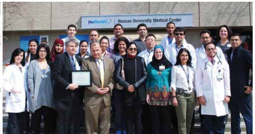
Nassau University Medical Center