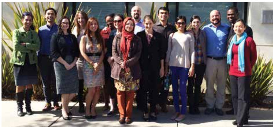
San Mateo County Behavioral Health and Recovery Services