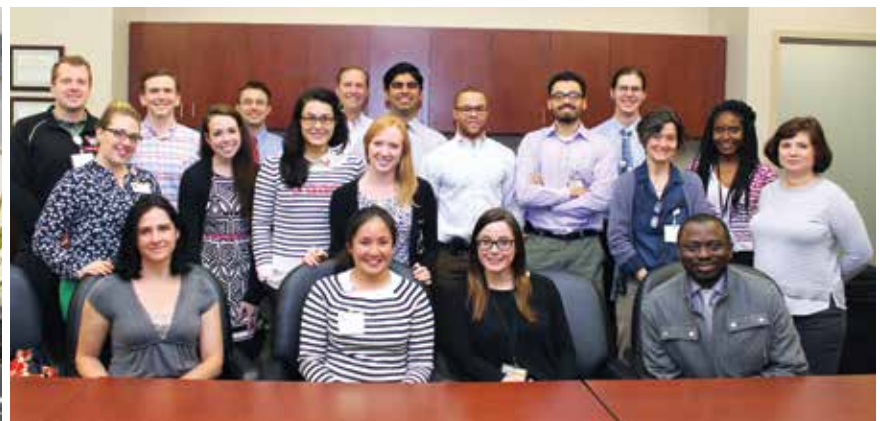
Wake Forest University School of Medicine