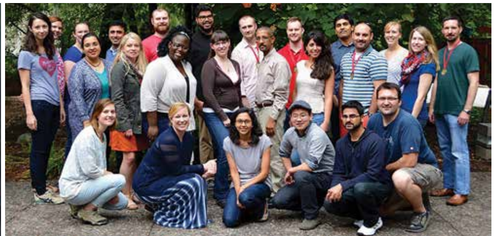
Medical College of Wisconsin