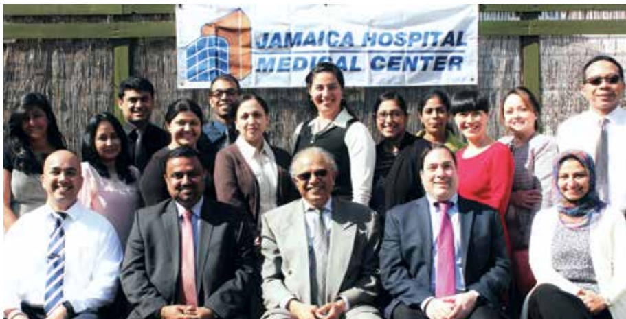
Jamaica Hospital Medical Center